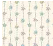
7331-EB Fat ¼ yd