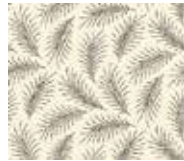
7332-K 3½ yds (backing)