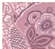
7324-E 1 yd (includes binding)