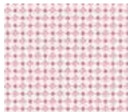
7390-BR ¾ yd