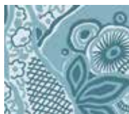
7324-B ¾ yd