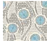
7326-B ¾ yd